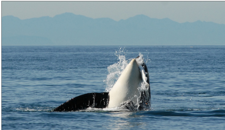
Orca eating salmon

• The change in leadership in the U.S. House may make passage of the Wild Olympics Wilderness bill a reality in 2019. Stay tuned.