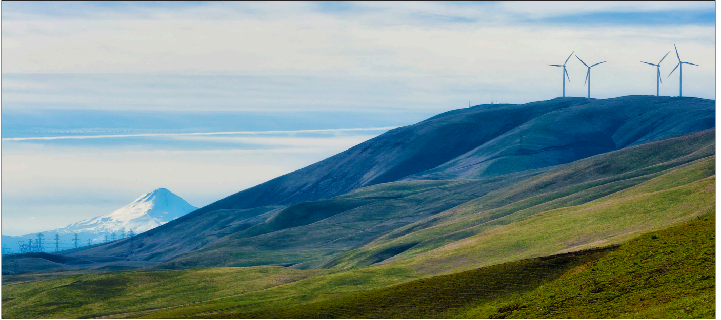
Wind Turbines, Columbia Gorge