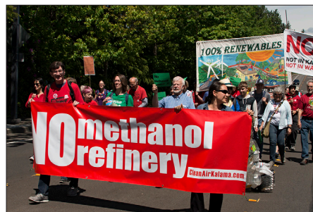
No Methanol Refinery