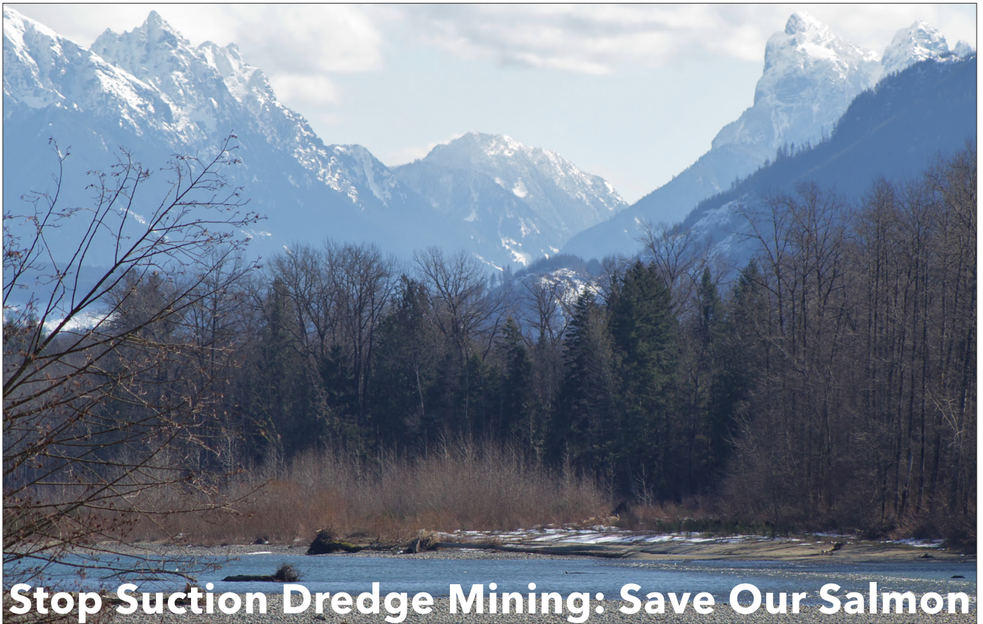
The Skykomish River & Cascade Mountains