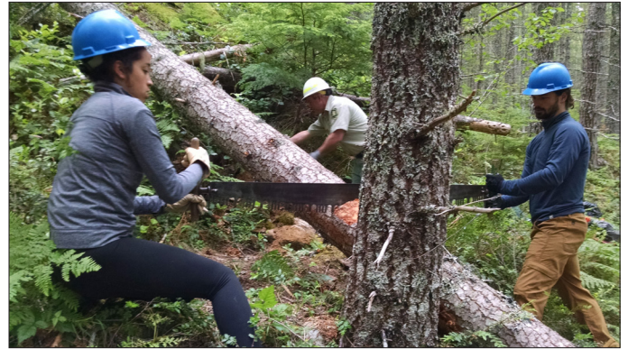
Meadow Creek trail maintenance

Our annual service projects brought out many volunteers and lots of well-earned thanks!