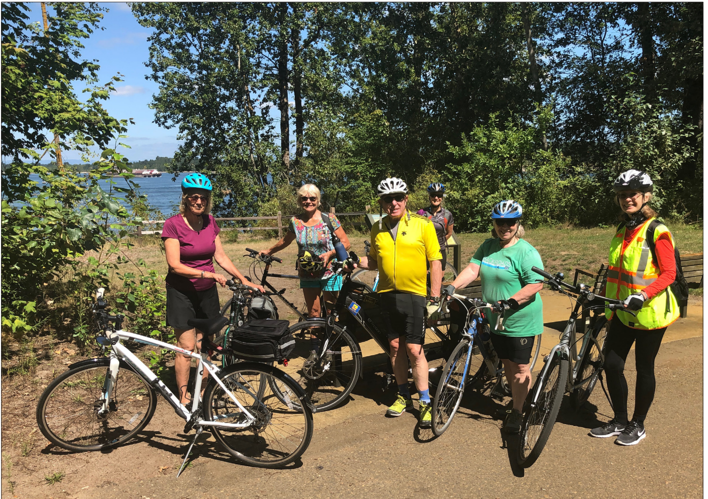
Sierra Club Outings - Top Left to Right: Snow Lake, Oyster Dome Lower Bottom: Biking