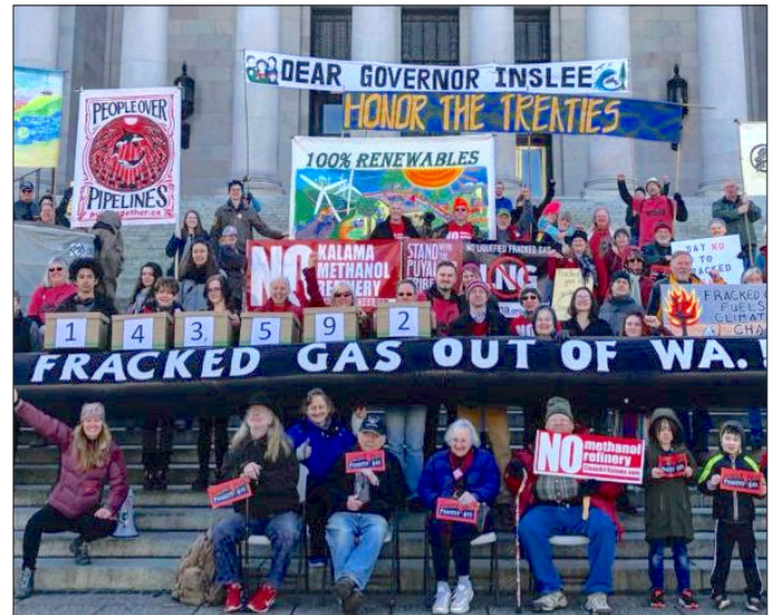
Activists continue to oppose huge new fracked gas refineries proposed in Tacoma and Kalama. Decisions are expected soon. Stay tuned!

It's Jack's way--do all things with enthusiasm, approach each campaign with excitement, and don't forget to get outside once in a while.