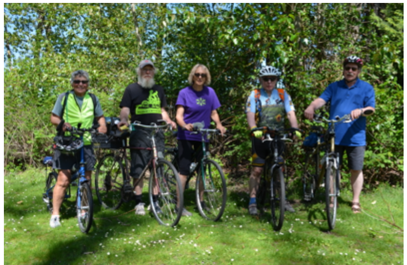
Sunday April 17th - Vancouver to Kelly Point bike ride and back