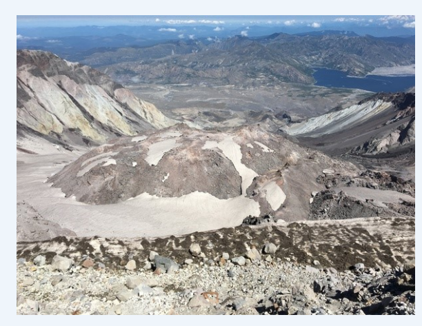
The Dome in the Crater

We made it back to the Climbers Bivouac a little less than 10.5 hours after we started. It was a great day with great views and lots of camaraderie. Everyone felt that it was worth the effort to see and climb one of the premier mountains in the Northwest.