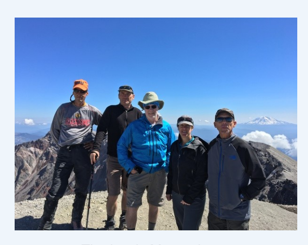
The hardy Mountaineers