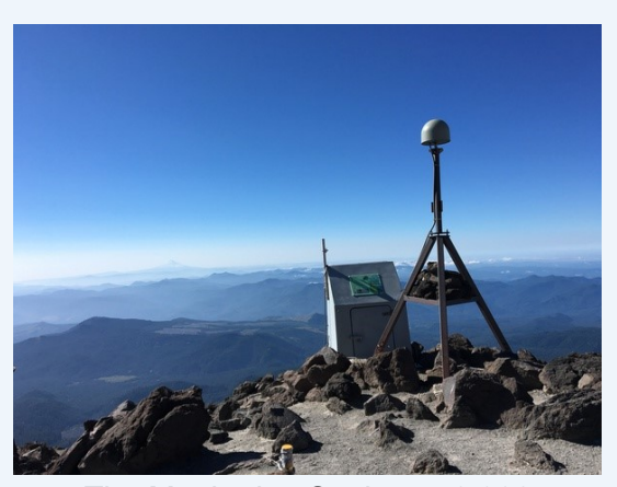
The Monitoring Station at 6,800

The day was beautiful and the views were astounding. We could see all of the major volcanoes, from Mt. Jefferson to Mt. Rainier. We stayed on top for an hour, eating lunch, and then made ur way back down the mountain, relishing the views we had left behind.