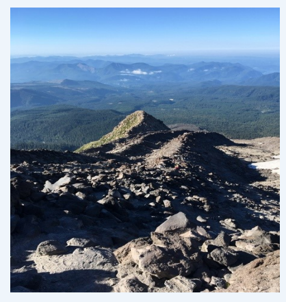
Looking down Monitor Ridge

At this point the climbing commenced, as we threaded our way through the boulder fields up to the Monitoring Station at 6,800'. There we took a short rest, preparing ourselves for the final 1,500' of rocks and mostly loose volcanic ash. A "fun time" was had by all by the time we had reached the summit.