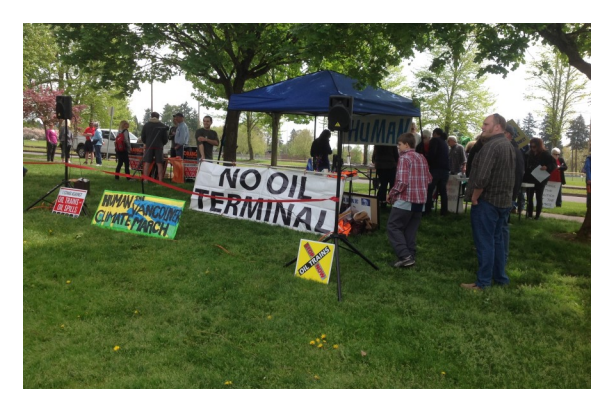
Photos from the Vancouver Climate March.