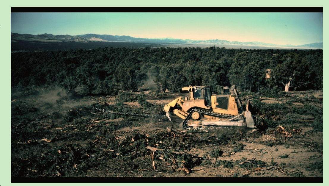
Footage from a video of the chaining method being used on public lands

If Trump and Zinke succeed in shrinking the boundaries of Bears Ears and Grand