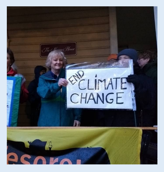
Participants at a rally to celebrate Governor Inslee's rejection of the oil by rail terminal

Three cheers for all who helped stop the oil terminal. On November 28, EFSEC voted to disapprove the project. On January 9, The Port Commission voted to end the lease for the oil terminal by March 31, 2017, if Tesoro Savage does not have all its permits and authorizations ready by then. On January 29, 2017, the Governor officially rejected the Tesoro Savage Oil Terminal. It would be almost impossible for Tesoro to get permits in time.