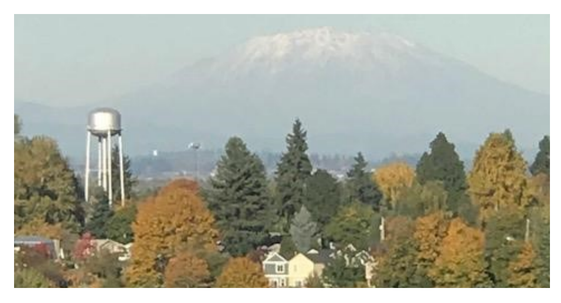
Smog visible looking from Linnton Oregon towards M. St. Helens.