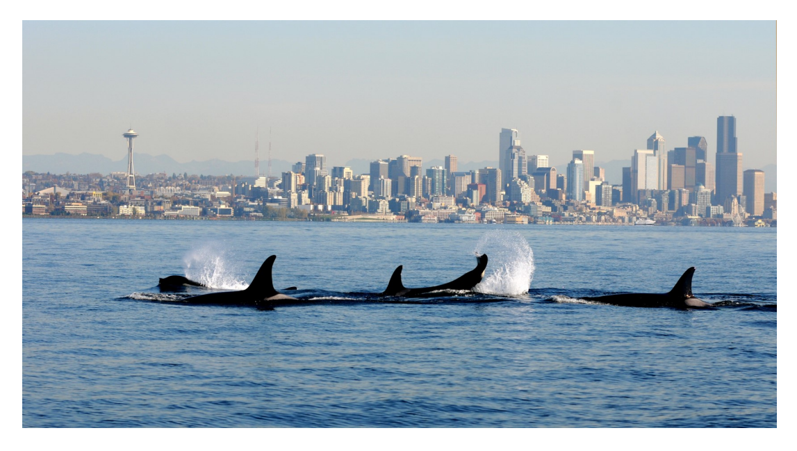
Orcas in Puget Sound with the Seattle skyline, via CBS news. Photo credit: Candice Emmons/NOAA via AP

How can you help? Read the Legislative Report on Page 5 of this newsletter, which talks about upcoming bills to help with Orca recovery, and then e-mail, write and call your legislator. Endless pressure, regularly applied, must be maintained to save these magnificent animals. You can also learn more about the OTF at the following websites: <a href="https://www.governor.wa.gov/issues/issues/energy-environment/southern-resident-orca-recovery">https://www.governor.wa.gov/issues/issues/energy-environment/southern-resident-orca-recovery</a>