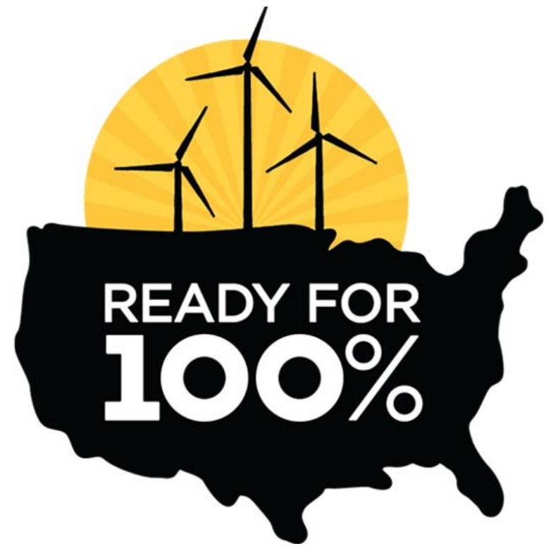
Ready for 100% logo

Oil wasn't even mentioned in this study, but as you know, we stopped what would have been the largest crude by rail terminal in Vancouver, WA. Our victories here in the Pacific Northwest actually number 66, too many to list in this article.