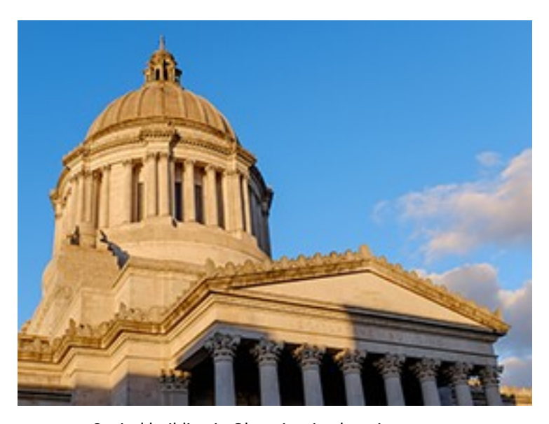
Capitol building in Olympia, via olympiawa.gov

Meeting with your representatives on lobby day is just one of the ways to engage with them. Developing a relationship over time is important for persuading them to vote the right way. Ways to do that include emailing or calling your legislator's office, arranging in-district meetings with them, and attending town halls and legislative district meetings. You can find your legislators' contact information and track the progress of bills at <a href="http://leg.wa.gov/">http://leg.wa.gov/</a>. One way to stay informed and take action is to join the Sierra Club's Washington State Lobby Team. Lobby Team members will receive regular updates and action alerts throughout the session. To sign up, visit <a href="https://www.sierraclub.org/washington/volunteer">https://www.sierraclub.org/washington/volunteer</a>.