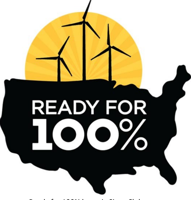
Ready for 100% logo

As I understand it, the law has not allowed public utilities to go after energy conservation opportunities unless they can be shown to be cost effective. Their formulas for cost effectiveness have not allowed them to include the avoided pollution cost if they stop polluting.