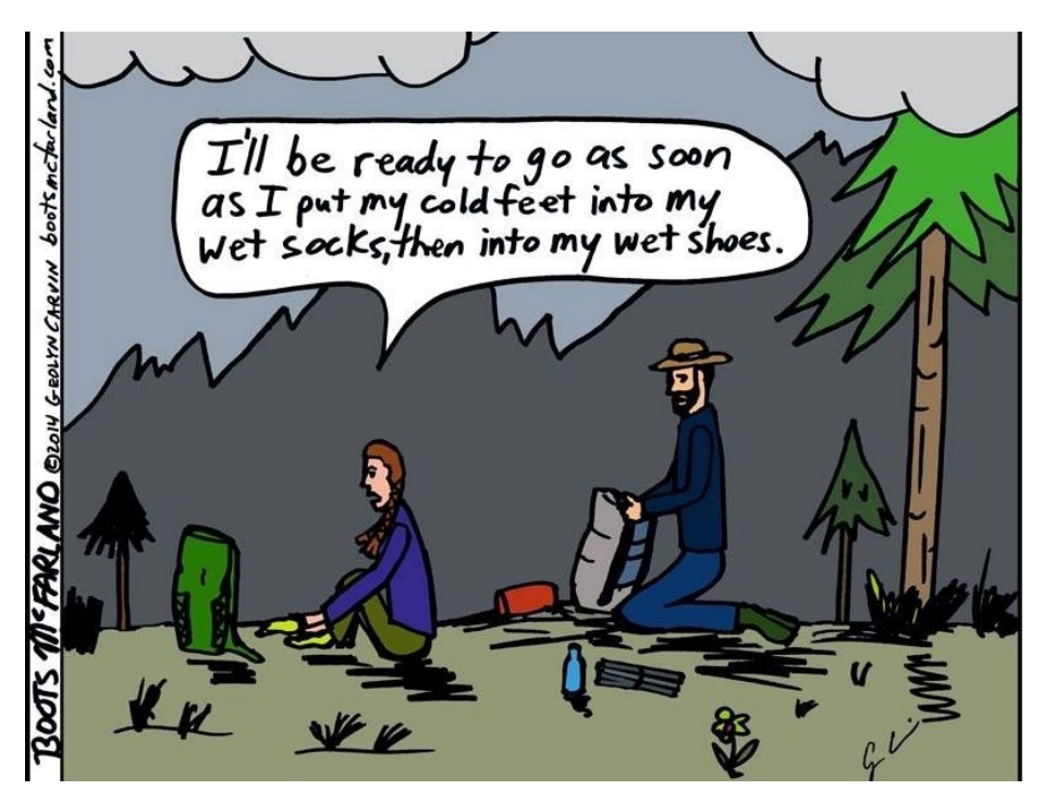
"Boots McFarland" comic by Geolyn Carvin

First bike outing is now set for Apr 28, barring rain. To see all outings postings, check the Meetup page for Loo Wit: <u>www.meetup.com/portland-vancouver-sierra-club-outings-events</u>.