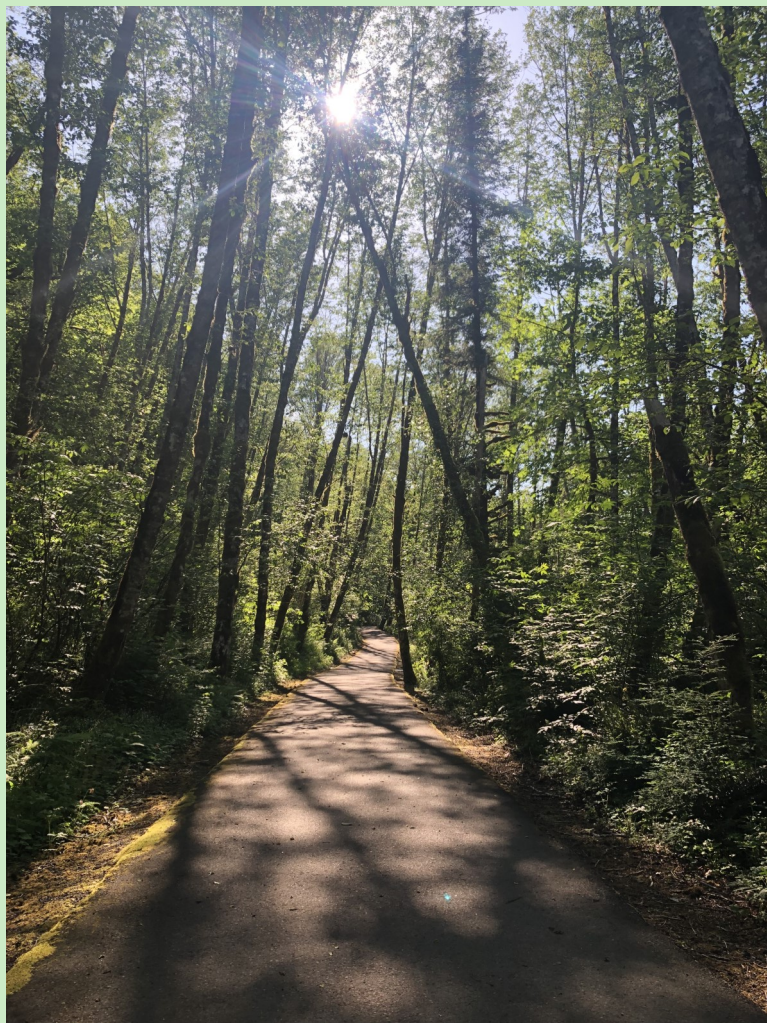
The Hantwick Trail on a summer day.

At this point, the beginnings of an intertrust transfer are being discussed as the most favorable solution, but the work is far from over. Please continue to write to County Councilors, Department of Natural Resource board members, and share this trail with your family and friends. Summer is the perfect time to walk the trail and take refuge from the heat along the shaded trail.