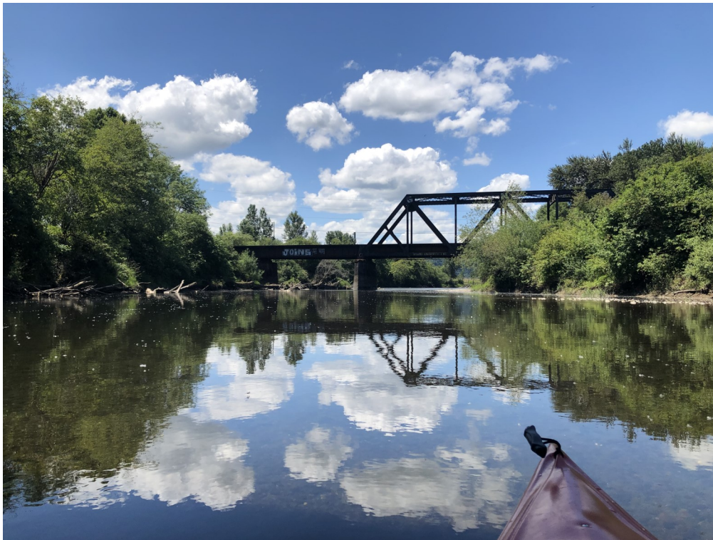
Kayaking the Kalama River

So far, sea kayaking and cycling outings are going well, and there have also been some great hikes. Loo Wit has sponsored three beginner/novice outings for those new to sea kayaking and has partnered with the Clark College Community Education program on another. We've also paddled the Kalama and East Fork Lewis Rivers. Bike outings have visited the Columbia River Highway State Trail in the Gorge and ridden the newly-opened section of the Renaissance Trail just west of the Port of Vancouver.