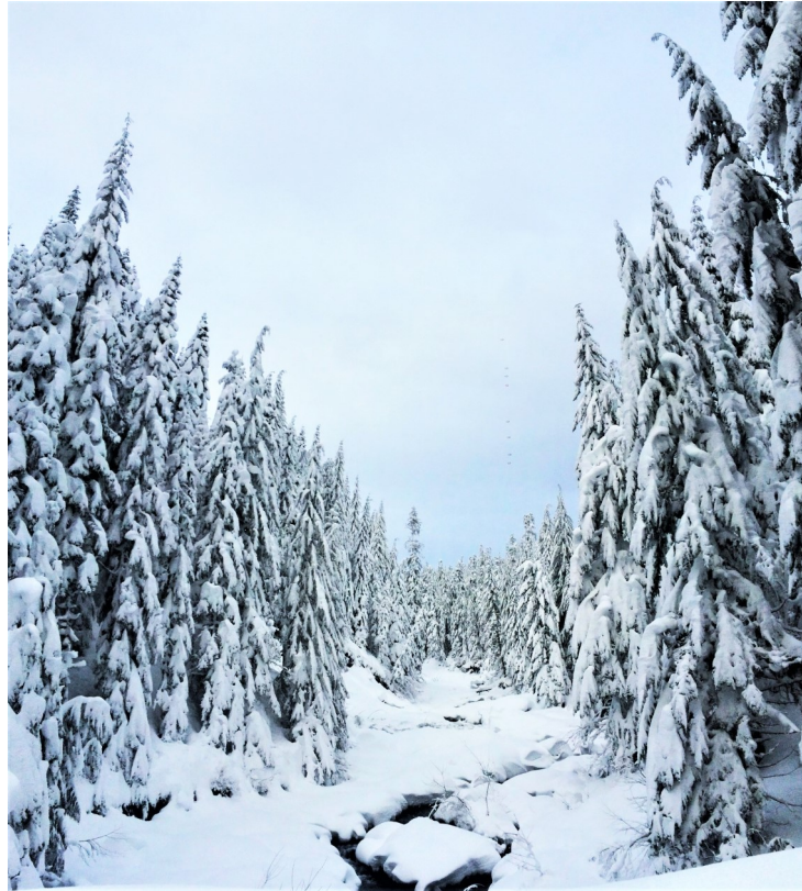
Over the river and through the woods...Join Loo Wit on a winter outing!