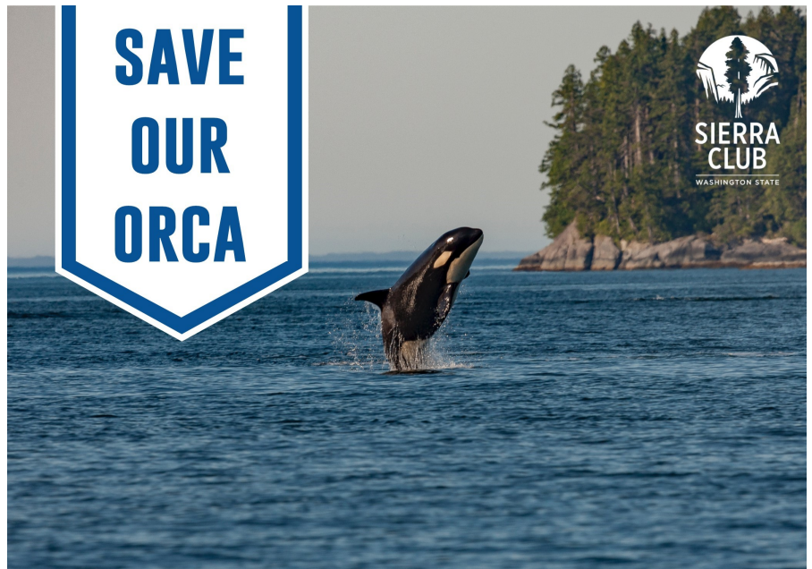
Save Our Orca image