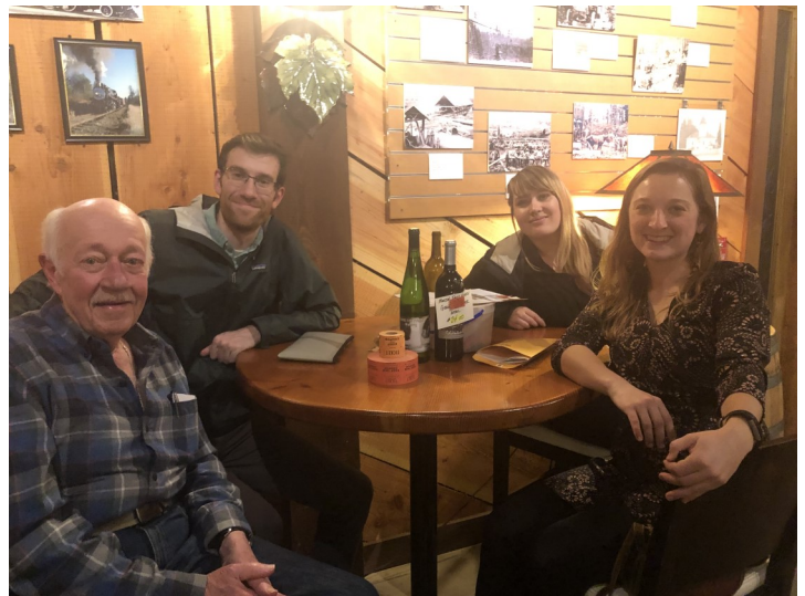
Sierra Club members enjoying the evening.

Thank you to all who attended the event! Stay tuned for further developments.