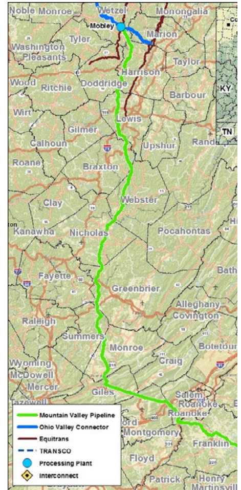
The proposed path of the Mountain Valley Pipeline.

For more information, search for Mountain Valley Pipeline on the following websites: appvoices.org , powhr.org , wvnews.com , and Roanoke.com . 🍃