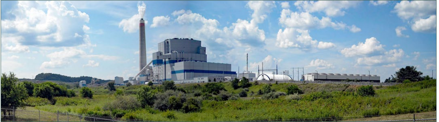
A View of Longview I. Will a Longview II make for double trouble in the region?

Longview II, a proposed gas-fired power plant north of Morgantown near the state line, would be adjacent to Longview I and Fort Martin, both coal-fired power plants. The proposal also contains a solar facility, most of which would be built in Pennsylvania. Like Longview I, its predecessor, the new plant would be a wholesale electricity producer for the PJM (Pennsylvania, Jersey, Maryland) markets, a regional transmission organization that markets and manages electricity in 14 states.