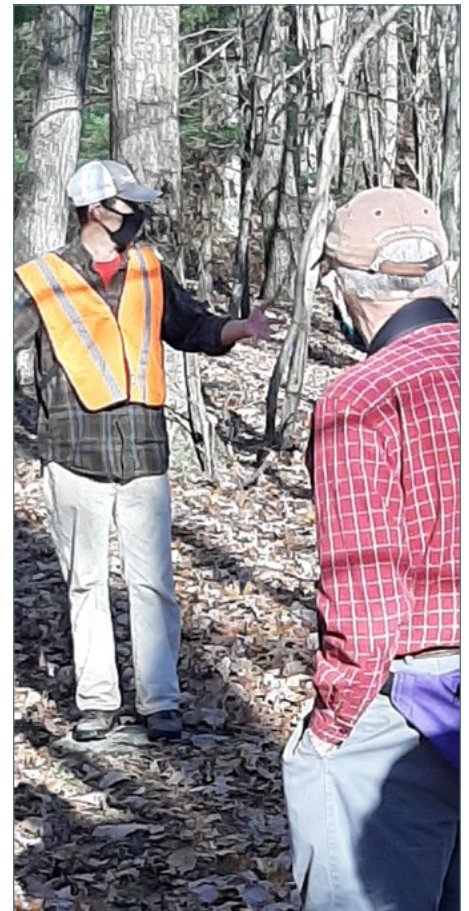
Second-growth forest (top) and educational presentation at Pennsylvania’s Pine Grove Furnace State Park.