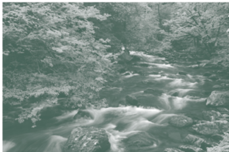
Pennsylvania’s Pine Grove Furnace State Park.

Some more helpful suggestions are at www.judyringer.com/resources/articles/being-heard-6-strategies-for-getting-your-point-across.php .