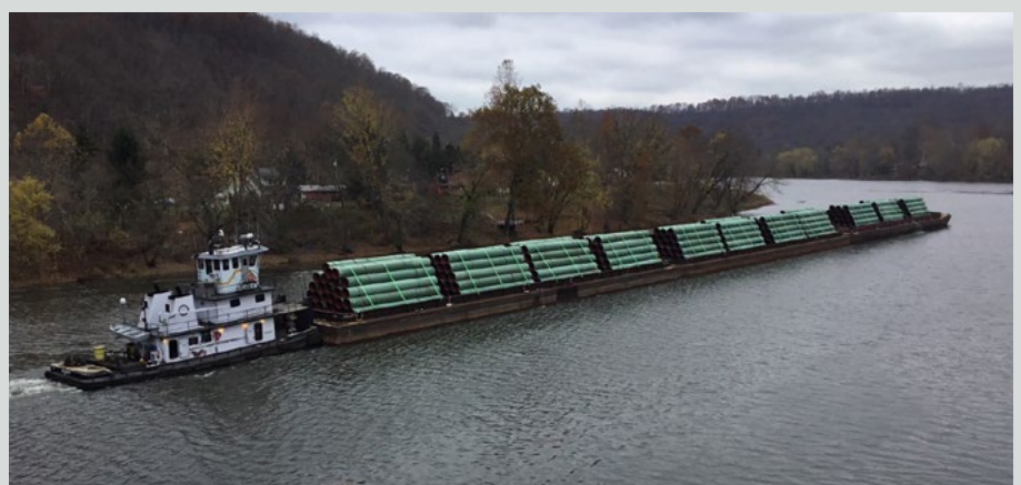
Goodbye, and good riddance! Pipes intended for the now-defunct Atlantic Coast Pipeline leave the storage depot in Morgantown, bound for Pittsburgh.