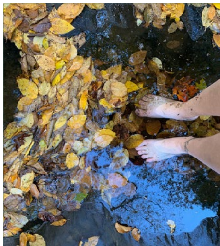
At Deckers Creek on an autumn day.

With the election of a new administration, it seems likely that EPA will repeal the ACE rule. But in the meantime, the WV Legislature passed HB 810 in March 2020, directing the WV Department of Environmental Protection (WVDEP) to adopt a state rule to implement the ACE rule. The rule (45-CSR-44) was the subject of a public hearing this summer and will be up for approval by the WV Legislature in the 2021 session, beginning in February.