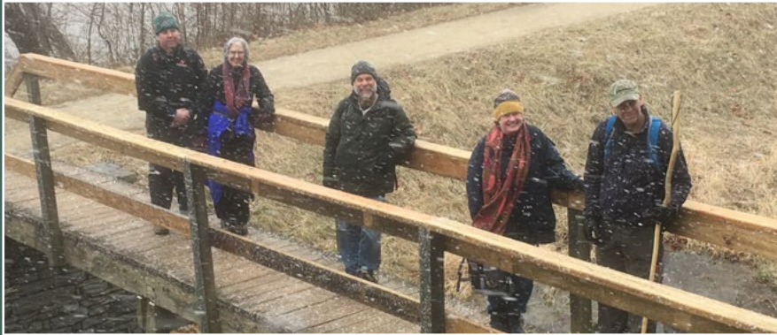
A little snow didn't stop this 2018 Sierra group on a hike at Maryland Heights, Harpers Ferry NHP.

Sierra Club's COVID-19-related ban on group outings and in-person meetings continues through at least February.