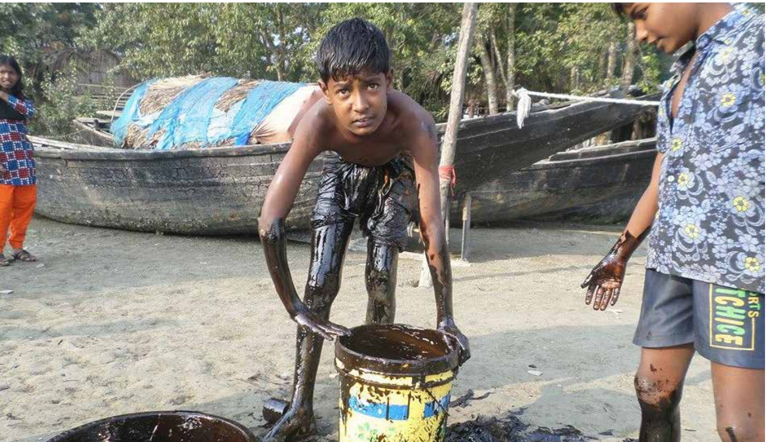
Due to lack of governmental and authoritative initiative local people are removing oil with whatever they have which might cause serious health injures to them.

is closely monitoring this issue, having already asked at least twice for detailed reports from the government. But the government of Bangladesh is still trying to justify this devastating project. What others are calling “devastation,” the government has tagged “development.” And under this name, the government has already given the greenlight to another power plant named Orion even closer to Sundarbans. But the question remains: is this really necessary? There are alternative, clean ways to produce electricity, but can we ever replace a unique forest like the Sundarbans?