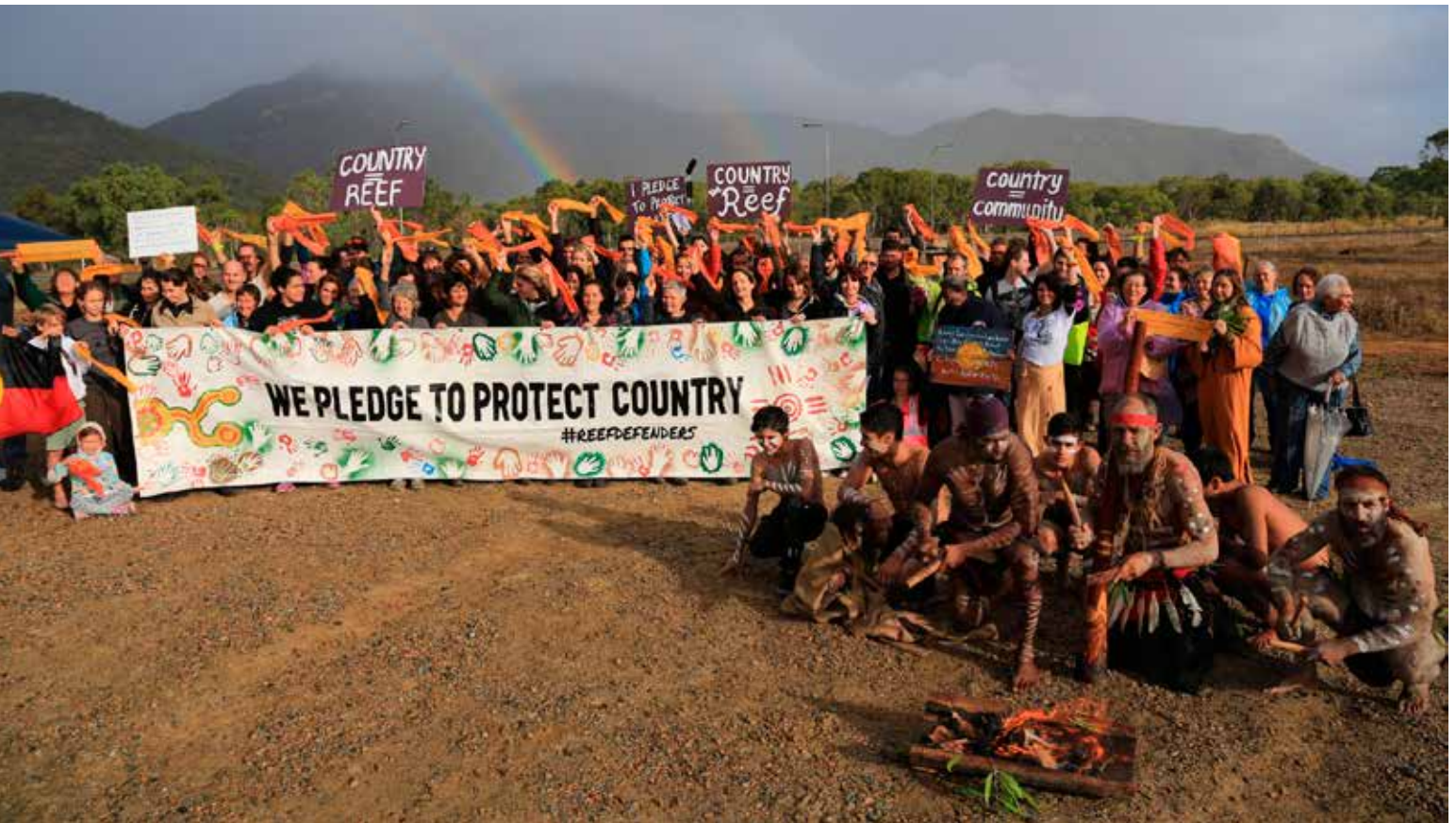
Over 120 people peacefully protest at the Abbot Point Convergence against mining company Adani's proposed Abbot Point and Galilee Basin coal projects.

Back in India, word was spreading that the Adani family was growing increasingly nervous about the pendulum swing in Australia. The realities started to sink in when Adani began dismissing contractors from the project—a total of six engineering firms, project managers, and contractors have been let go from the project to date—and then news hit that the Indian mining giant was firing its own Brisbane-based staff.