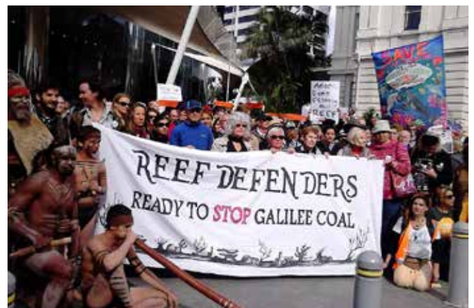
300 Queenslanders join Reef town locals and Traditional Owners at Adani's Australian HQ to deliver pledges to take action to stop the Galilee coal mines, protect country, climate and Reef.

It is amazing what a difference a few months can make. A concerted grassroots campaign that has thought globally, acted locally, and fought creatively, now has the big bad coal industry against the ropes. The fight's not over yet, but in this David vs. Goliath battle, our bet is on underdog to come out on top.