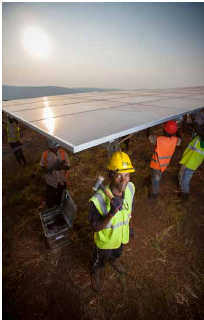
The recent 8.5 MW Gigawatts PV system in Rwanda.

Why is coal so dangerous? First is the smoke and sulphur dioxide emissions laden with heavy metals that, unscrubbed, cause smog, acid rain, and contamination of water sources. Just look at the pictures of Chinese cities. Second are the thousands of tonnes of coal ash that must be disposed of each day. Third is the environmental degradation of coal mining sites that take place wherever the fuel is dug