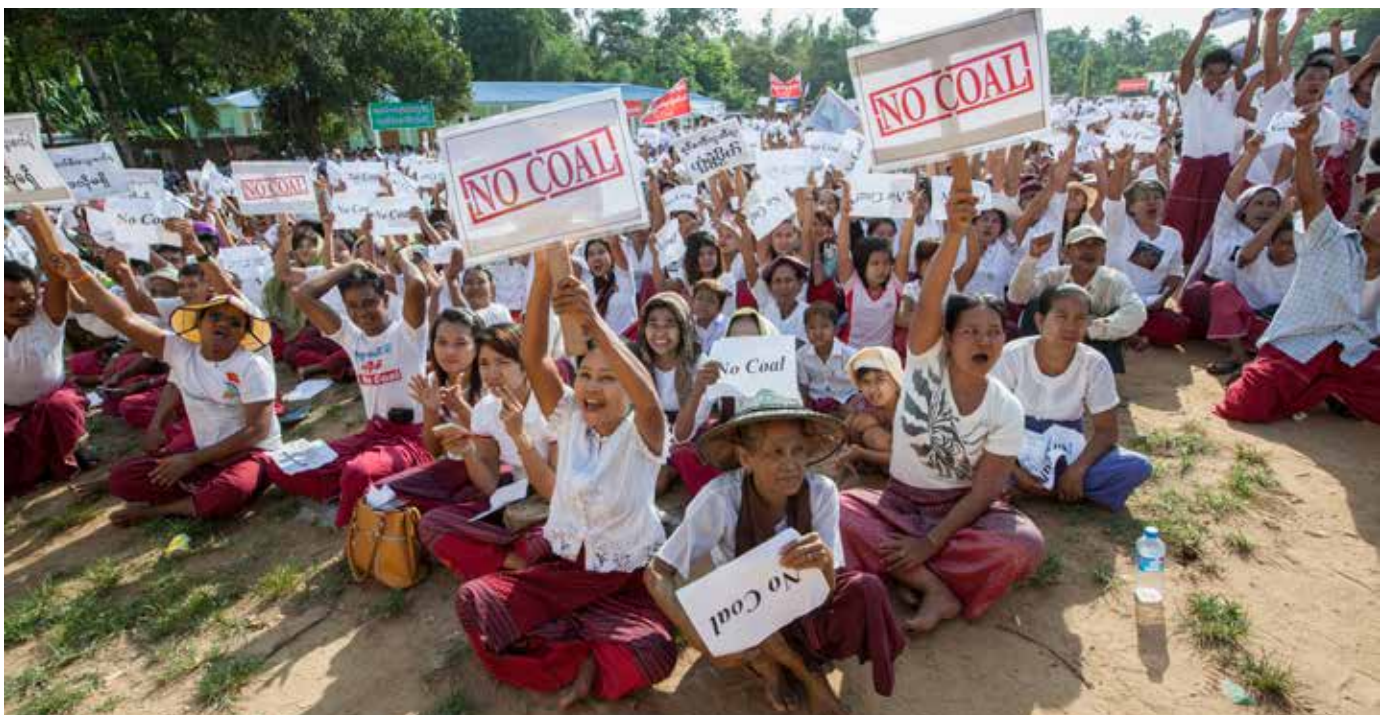
Andin community in Myanmar rallies against coal.

Andin is part of Ye Township in Mon State, which sits in the narrow southern strip of Myanmar, bordered by Thailand on the east and the Bay of Bengal on the west. Peace in Mon is relatively new. The state was blacklisted by the former military dictatorship, and the Mon language and history were banned in schools. In 2010, the new government signed a ceasefire with the armed Mon group, opening the door for infrastructure and development. Now the people in Andin can openly teach their culture at a Mon language school in the village. But some are worried the coal plant will bring new conflict to the village, pitting the Mon people against Burmese immigrants who came to the area looking for work.