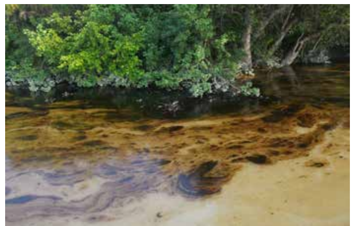
Oil is spreading drastically with everyday’s tidal surge and has already reached over 350 square kilometers area inside the forest.

call is clear. With clean energy alternatives readily available to meet Bangladesh’s growing energy needs, no one believes the Sundarbans is the place set Bangladesh’s largest coal plant. The November oil spill disaster has already shown what might happen if the plant is built. The alarms are sounding, and people are calling on the government to save the mighty Sundarbans.