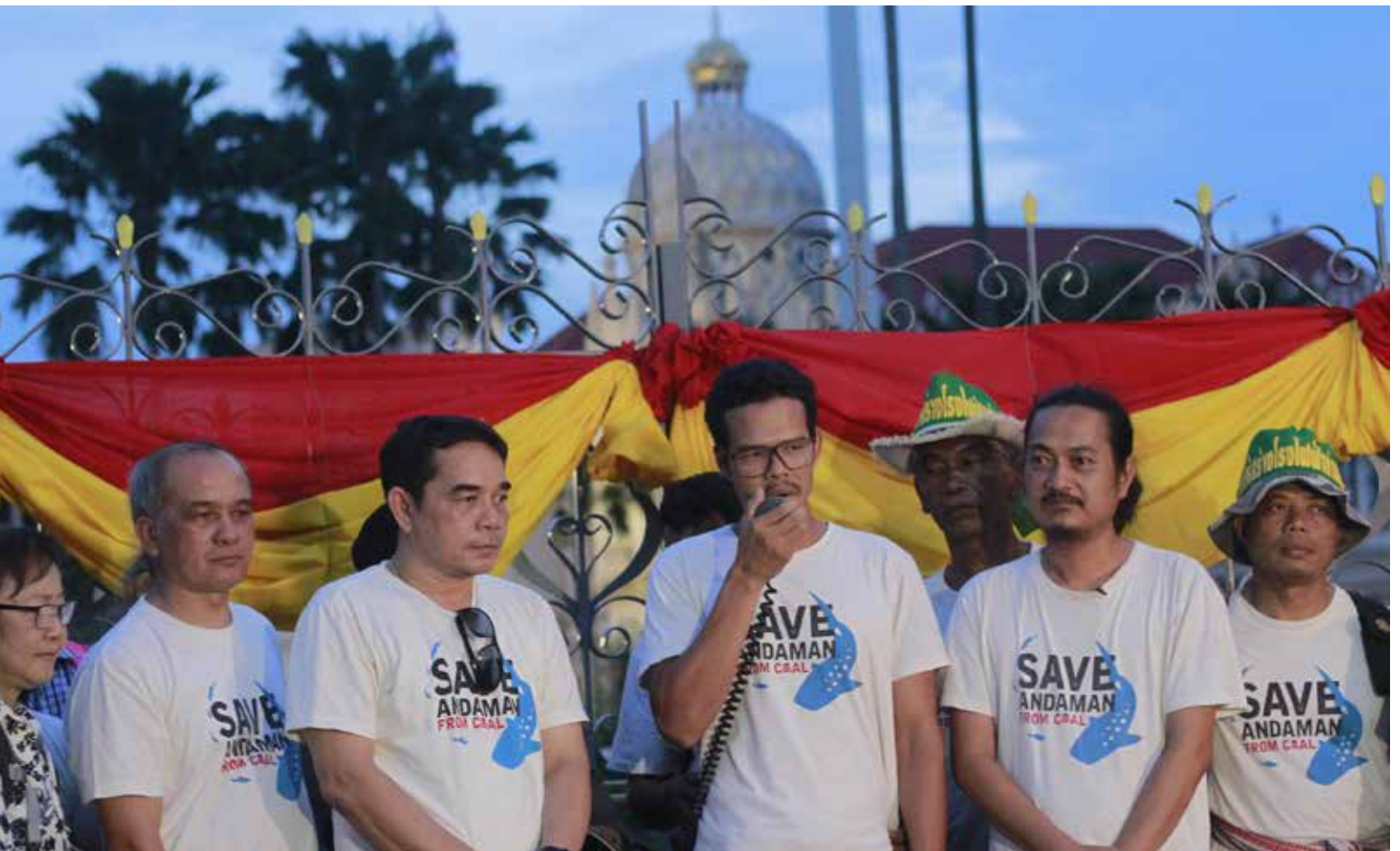
Hunger Strike in front of Ministry of Tourism and Sport, Government House.

As we approach to the fourth anniversary since derailing the Krabi coal-fired power plant and coal sea port project, the isolation of the Krabi anti-coal network is growing and branching out to local communities under the threat of the future chimney of the coal power plant project, including local fishery folks, the provincial fishery association, the Southern local fishery network, the Krabi tourism and hotel association, the Krabi Chamber of Commerce,