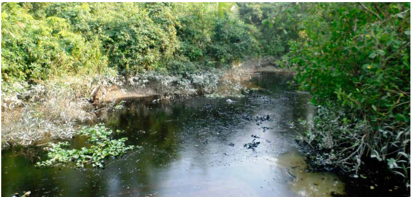
Oil is spreading drastically with everyday's tidal surge and has already reached over 350 square kilometers area inside the forest.

Recently, South Asian for Human Rights (SAHR) also expressed their concern over energy development in the Sundarbans, and UNESCO