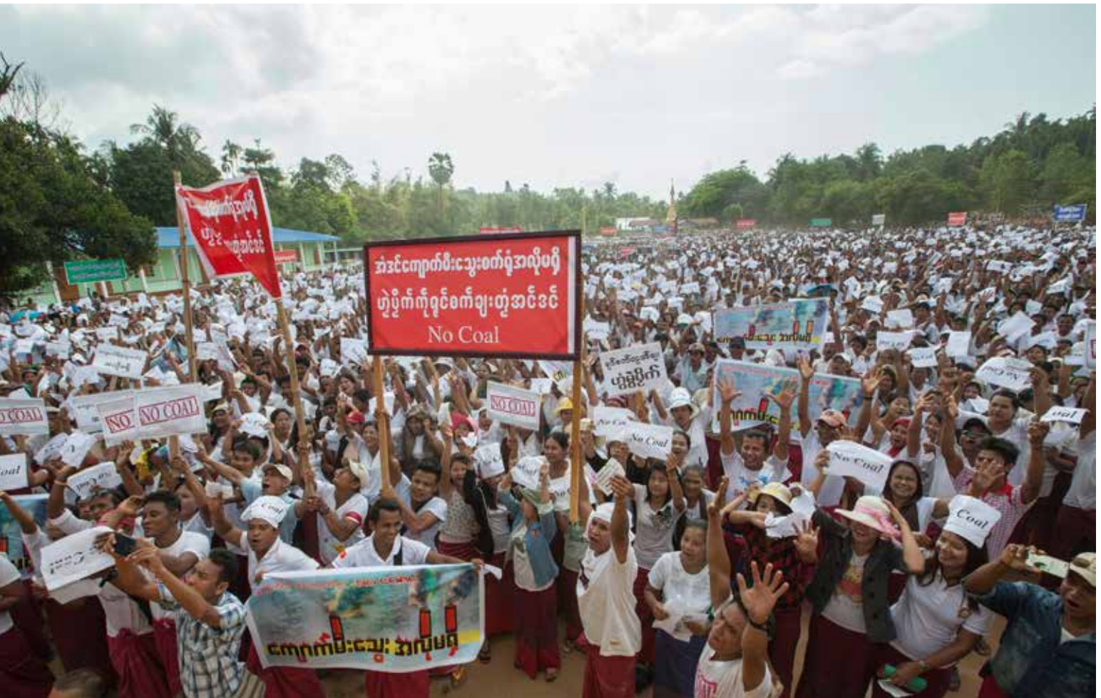
Andin community in Myanmar rallies against coal.

Andin Village is relatively prosperous. In a country with only 33 percent electrification, residents have access to electricity and the village has private business wifi for public use. But even if this wasn't the case and the village was not electrified, it is very possible that the people would not benefit from power generated from a new power plant. It is more profitable to sell electricity to nearby Thailand than to keep the power in Myanmar. This is why many foreign companies looking to build coal plants in Myanmar plan to send the vast majority of the electricity over the border.