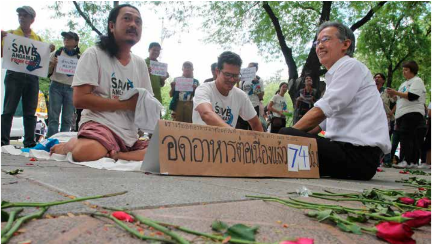
Hunger Strike in front of Ministry of Tourism and Sport, Government House.

the Southern Chamber of Commerce, the Tourism Council of Andaman, the Tourism Council of Thailand, and also academic and expert groups on energy, economic and environment, together which support more than 200 civil society groups in country.