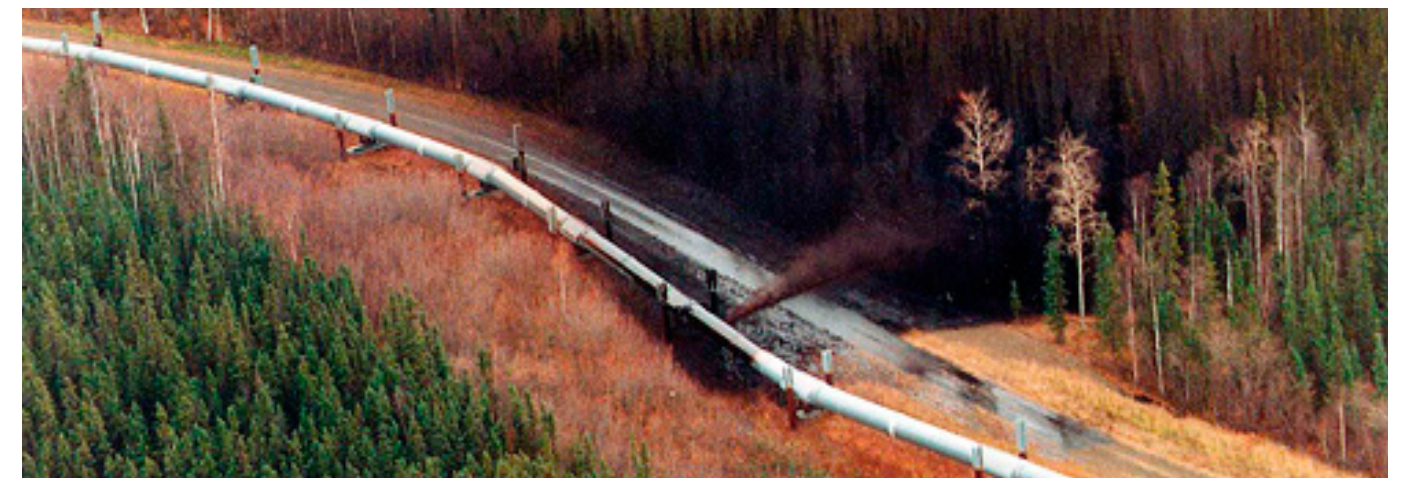
AN OIL PIPELINE IN ALASKA, PARTIALLY OWNED BY BP, LEAKED MORE THAN 6,000 BARRELS OF OIL IN OCTOBER 2001 AFTER A LOCAL RESIDENT SHOT A HOLE IN IT.

Indeed, corporations that would be empowered to launch ISDS cases against the U.S. government