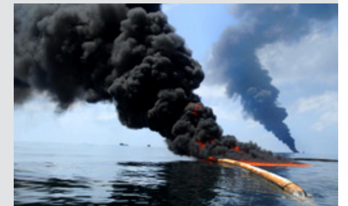
A CONTROLLED BURN FOLLOWING BP'S APRIL 2010 OIL SPILL IN THE GULF OF MEXICO.

Under TTIP, BP would gain a new, more powerful tool to lobby against proposed U.S. climate protections – the threat to launch costly and unpredictable ISDS cases if such protections were enacted. If BP’s ISDS threats failed to halt, delay, or water down a proposed U.S. fossil fuel restriction, the corporation would be empowered to ask an ISDS tribunal to order U.S. government compensation. It would not be the first ISDS case for BP – the corporation launched a case against Argentina in 2003, in part to protect its claimed “right to freely export hydrocarbons.” 80 Argentina decided to settle the case after losing to BP on a jurisdictional ruling. 81