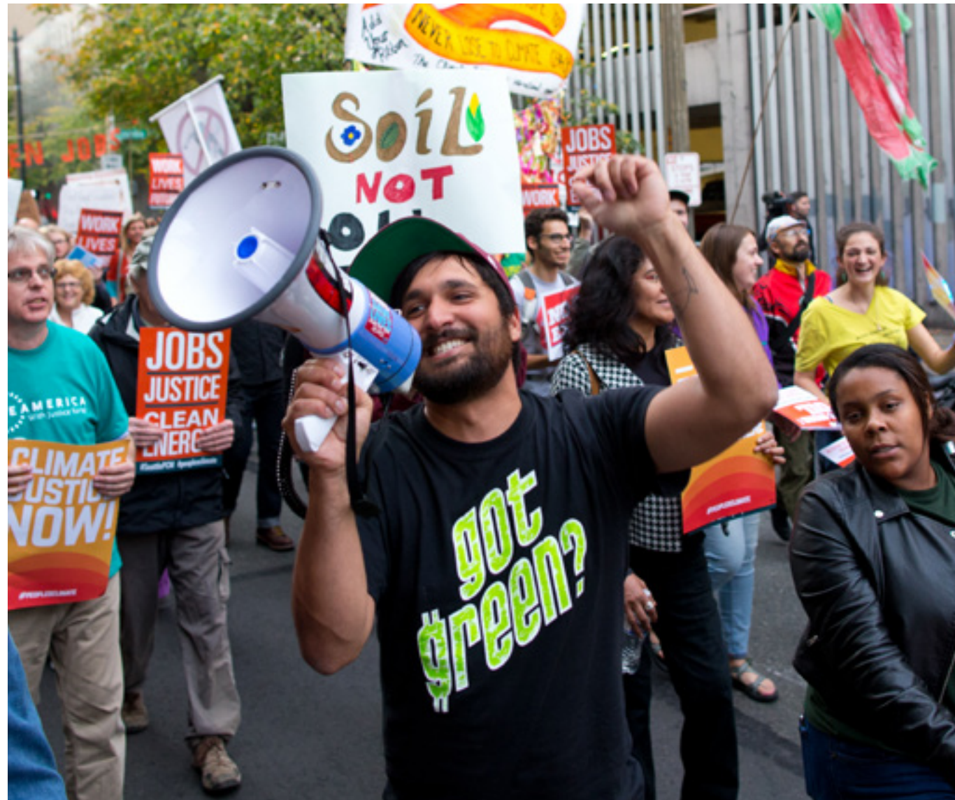
AN ORGANIZER FROM GOT GREEN? RALLIES THE CROWD DURING THE PEOPLE'S CLIMATE MARCH IN SEATTLE, WA, ON OCTOBER 14, 2015.

Australia (empowered under the TPP) Crude Petroleum and Natural Gas Extraction