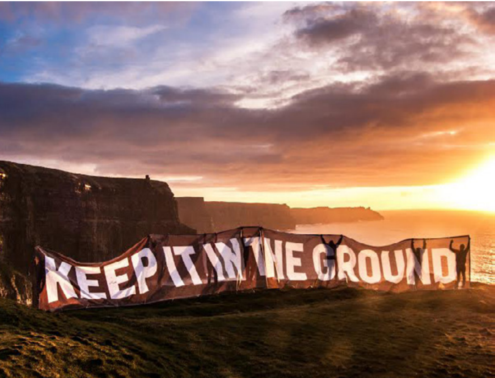
CLIFFS OF MOHER, IRELAND, NOVEMBER 2015. PHOTO: EAMON RYAN / 350.ORG