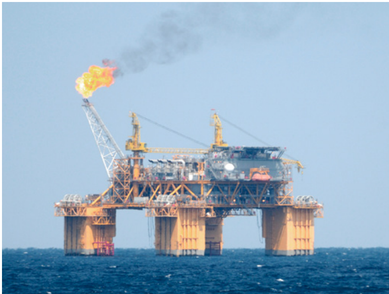
OFFSHORE OIL PRODUCTION PLATFORM WITH FLARE STACK, GULF OF MEXICO.