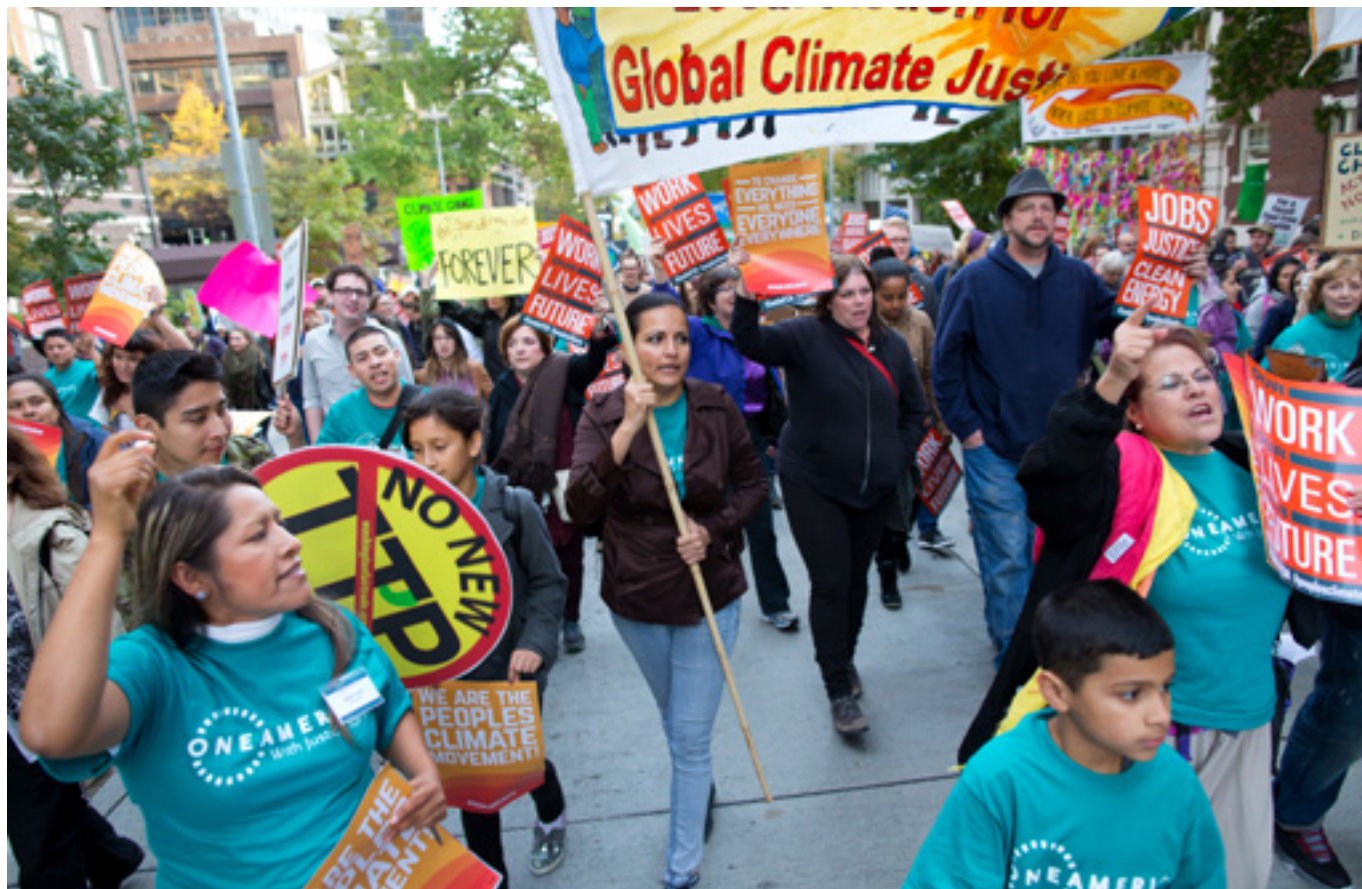
HUNDREDS RALLY DURING THE OCTOBER 2015 PEOPLE'S CLIMATE MARCH IN SEATTLE, WA.

Corporations' use of such ISDS cases has surged: Foreign investors have launched more ISDS cases