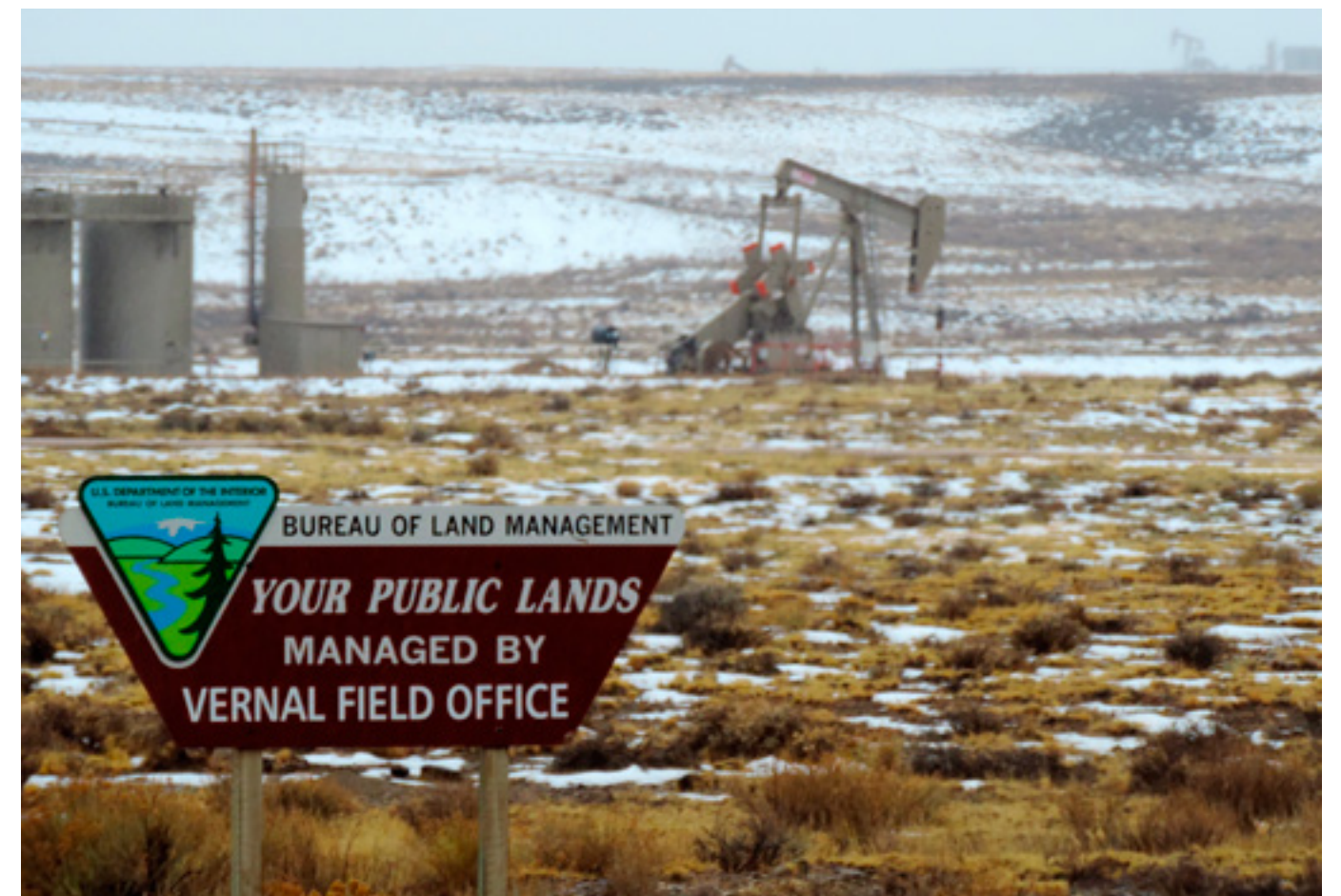
OIL DRILLING ON PUBLIC LAND IN VERNAL, UTAH.

The good news is that 93 percent of these potential greenhouse gas emissions from federal lands are on land that the government has not yet leased to fossil fuel corporations. 216 In September 2015, more than 400 environmental organizations, including the Sierra Club, urged President Obama to “take the bold action needed to stop new federal leasing of fossil fuels, and to keep those remaining fossil fuels – our publicly owned fossil fuels – safely in the ground.” 217 Just four months later, the Obama