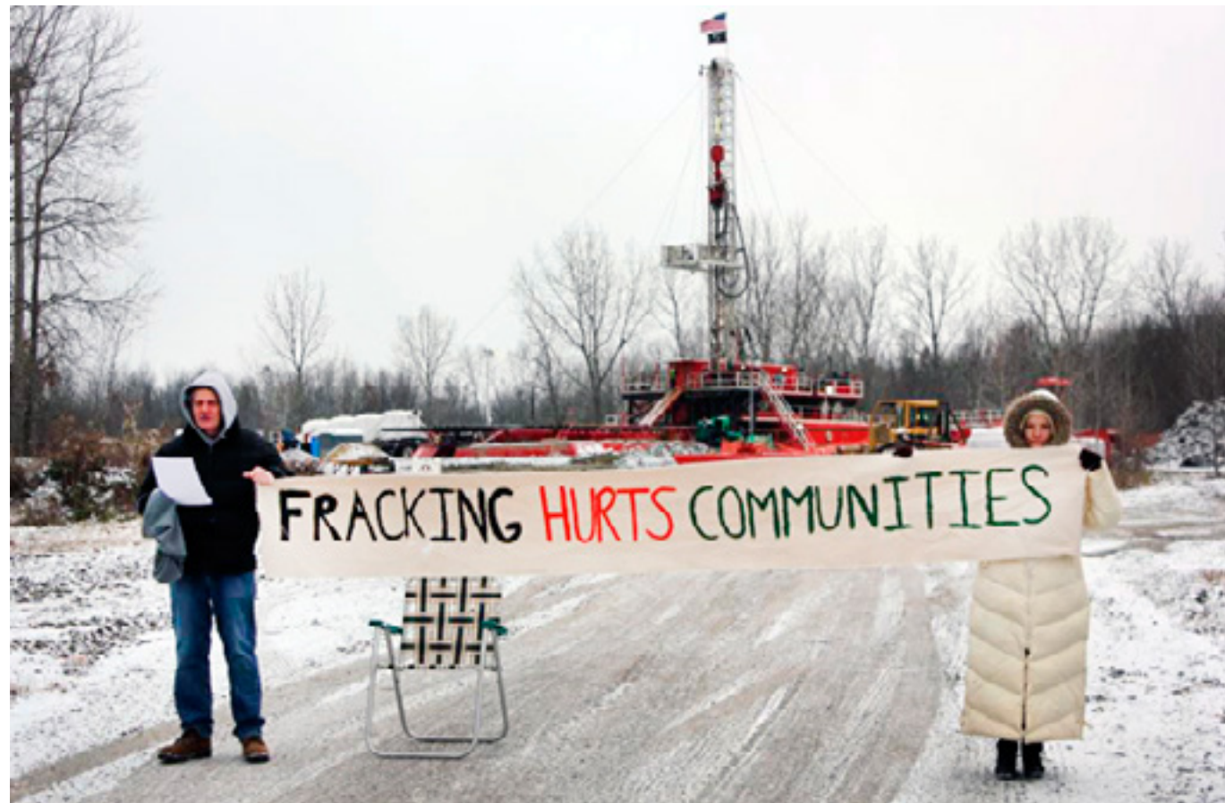
PROTESTERS BLOCK TRUCKS FROM ENTERING A FRACKING SITE IN NILES, OH, NOVEMBER 2013.

Incredibly, ISDS tribunals have repeatedly decided that foreign investors’ right to a “minimum standard of treatment” can obligate a government to compensate a foreign corporation for policy changes perceived as arbitrary or as thwarting the corporation’s expectation of regulatory consistency. 120 For example, in an ISDS case that Occidental Petroleum launched against Ecuador, the tribunal concluded that “the stability of the legal and business framework is...an essential element” of this broad foreign investor right. 121 And in March 2015, an ISDS tribunal ruled against Canada for denying a mining project that was rejected by an environmental review panel, opining that Canada’s decision was “arbitrary” and contrary to “reasonable expectations,” and that this violated U.S. mining firm Bilcon of Delaware’s right to a “minimum standard of