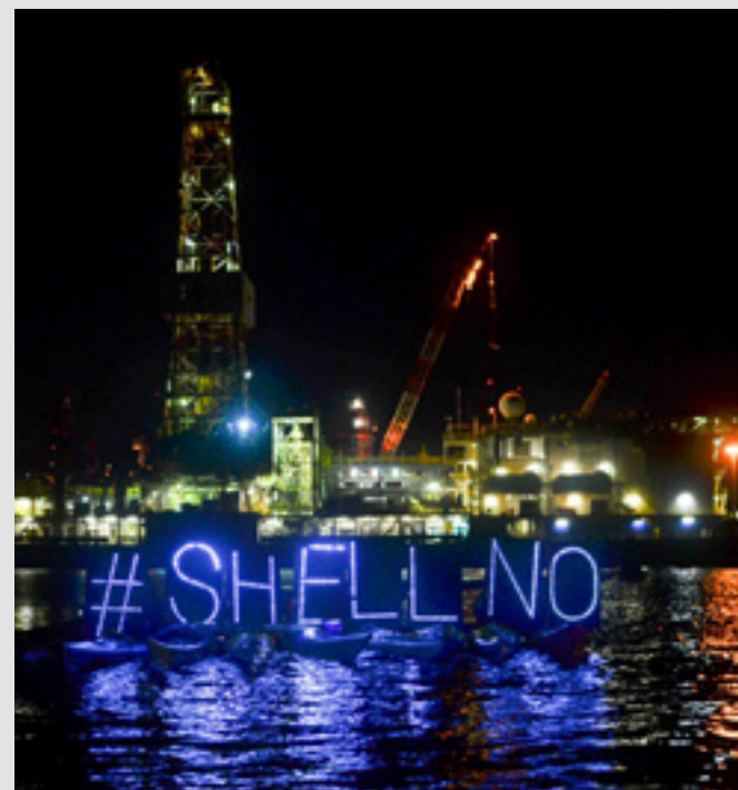
ACTIVISTS DEMONSTRATE AGAINST SHELL IN EVERETT, WA IN JUNE 2015.

Shell already has launched ISDS cases against Nicaragua and Nigeria, the latter of which focused on Shell's offshore oil drilling rights. Both cases have been resolved. Nicaragua, and potentially Nigeria, agreed to a settlement, though details are not publicly available. 97 TTIP would grant Shell the ability to make the U.S. government a next ISDS target if its standard lobby efforts do not succeed in stopping proposed fossil fuel restrictions.