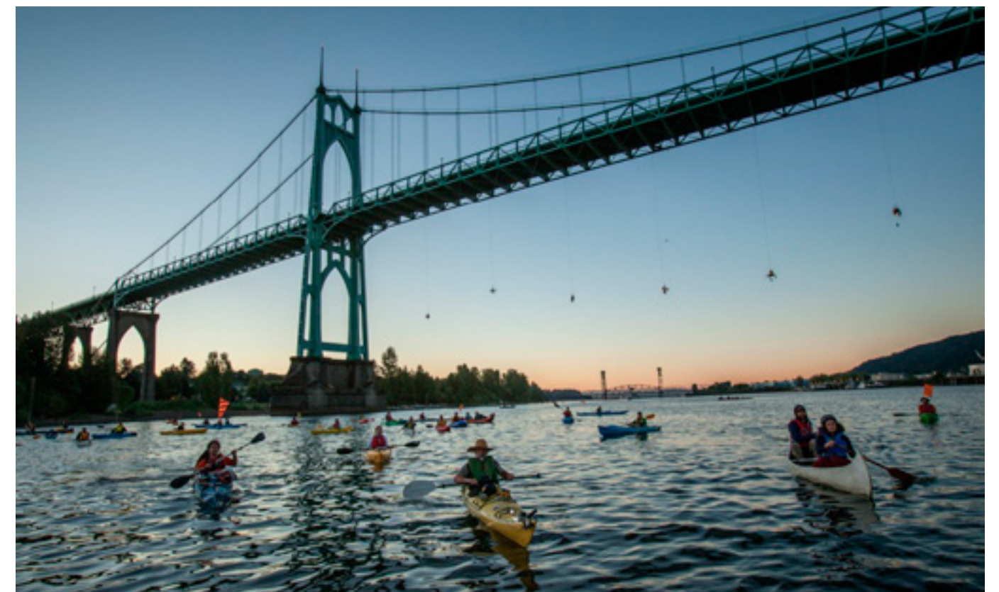
PROTESTERS SUSPEND FROM THE ST. JOHNS BRIDGE IN PORTLAND, OR TO BLOCK A SHELL VESSEL SCHEDULED TO LEAVE FOR THE ARCTIC, JULY 2015.

Further offshore drilling also would exacerbate the climate crisis. As mentioned, scientists and energy experts estimate that about 80 percent of the world’s known fossil fuel reserves must stay in the ground if we are to avoid disastrous levels of climate change. 168 A seminal January 2015 study concludes that meeting this goal requires abandoning any