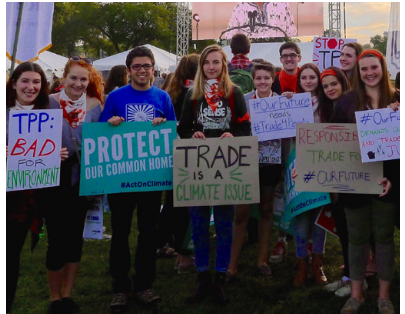
ACTIVISTS RALLY AGAINST THE TPP AND FOR A CLIMATE-FRIENDLY TRADE MODEL IN WASHINGTON, DC, SEPTEMBER 2015.

The fight for climate progress already faces enough obstacles without the additional roadblocks imposed by the TPP and TTIP. Replacing these toxic deals with a new climate-friendly model of trade is an essential component of the growing effort to keep fossil fuels in the ground.