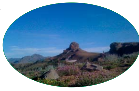
Jeff Davis Peak in Mokelumne Wilderness

Since founded in Colorado in 1992, the Wilderness Land Trust has protected 362 parcels, comprising 37,493 acres in 84 designated and proposed