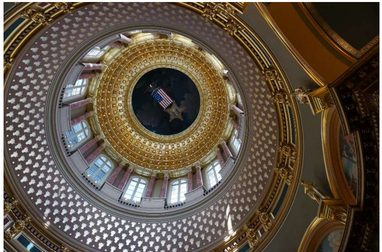
Dome of the Iowa Capitol