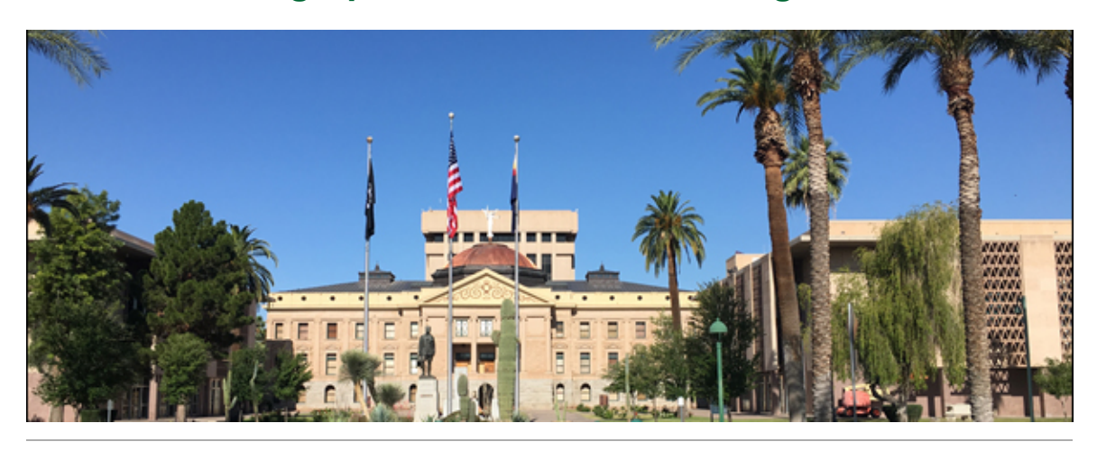
Historic Capitol