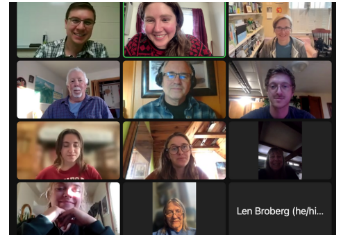
A zoom gathering for our Legislative Committee that meets every Monday during the session