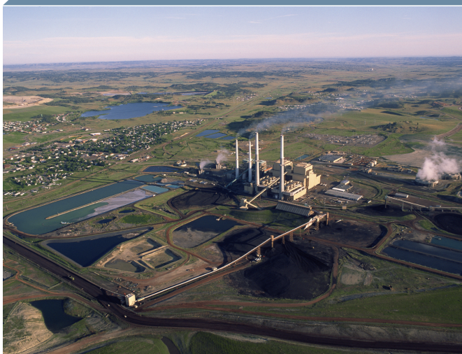
Gas plant in Laurel, Montana, from the Daily Montanan