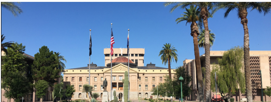
Historic Capitol