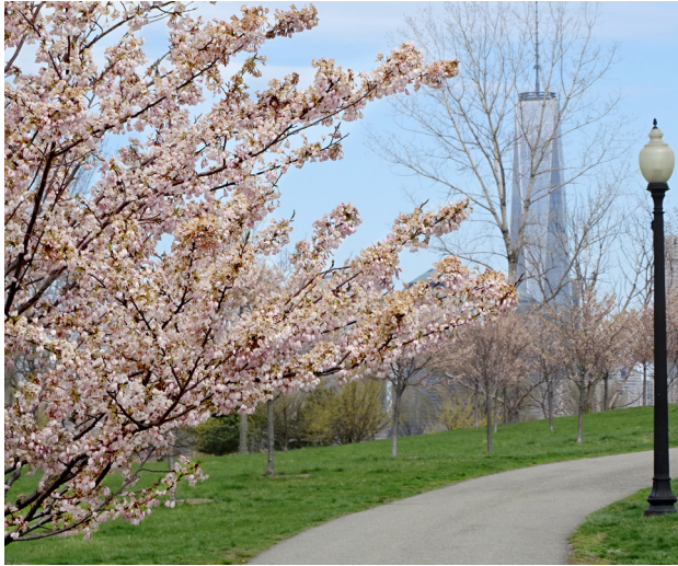
LIBERTY STATE PARK

Sierra Club members work to address local and state issues across New Jersey. Our volunteers host educational activities and outings. Staff and volunteers work together on legislative and conservation activities.