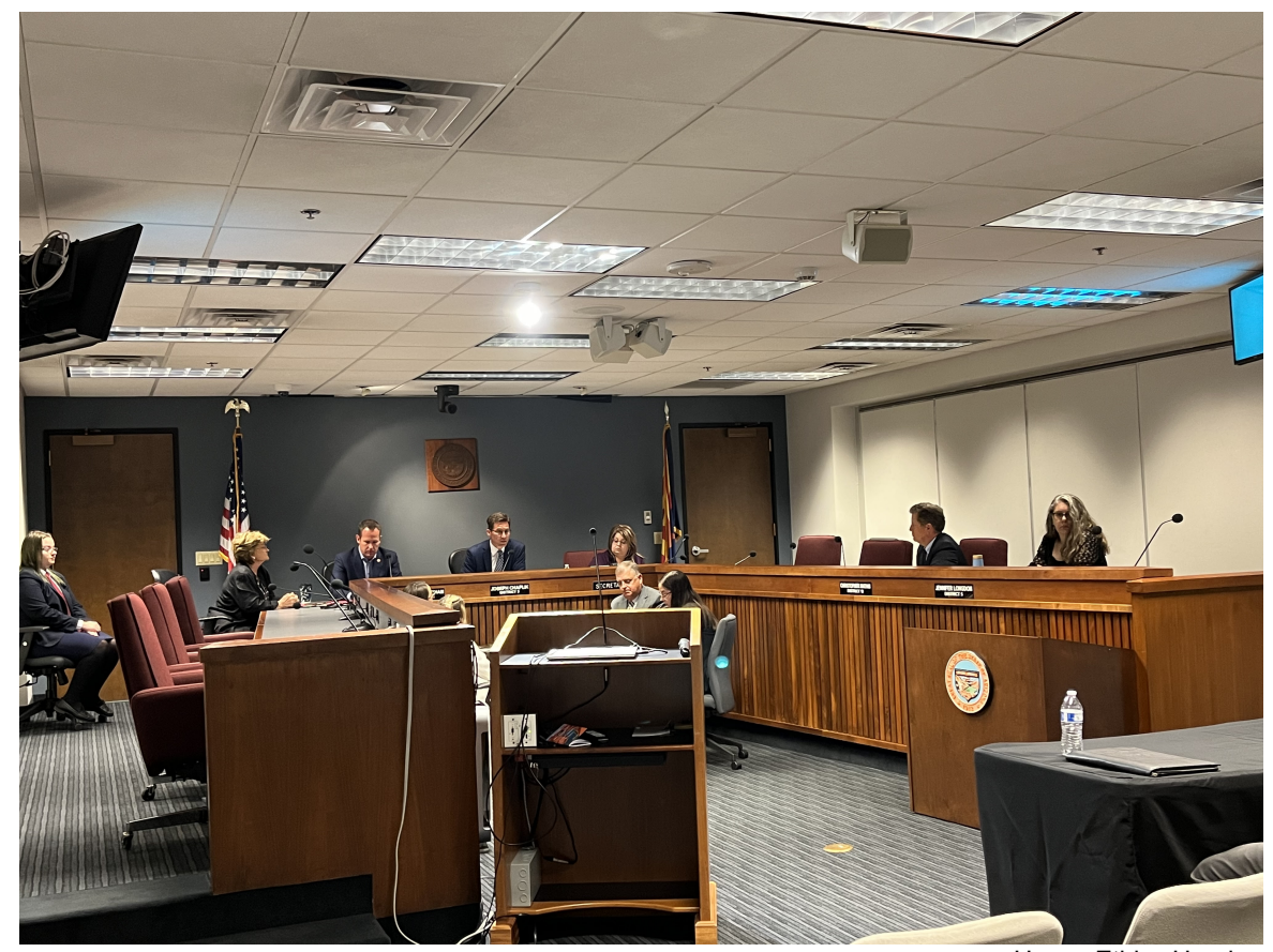
House Ethics Hearing