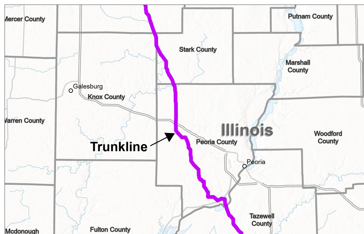
Proposed route of Wolf-ADM CO2 pipeline filed by Wolf Carbon Solutions with the Illinois Commerce Commission on June 16th, 2023.

While the Wolf Carbon Solutions US (WCSUS) LLC filing to the Illinois Commerce Commission did not contain a pipeline into the city of Peoria, the company can clearly adjust their route and make changes. The city of Peoria still needs to be very concerned about this project. More »