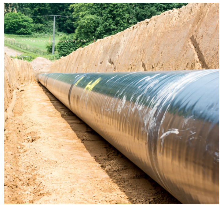
The proposed Atlantic Coast Pipeline would generate an estimated 68 million metric tons (MMT) of carbon dioxide equivalent every year

The production, processing, storage, transmission, and distribution of fracked gas leaks immense amounts of a dangerous greenhouse gas into our atmosphere. Unburned fracked gas consists primarily of methane, and while carbon dioxide remains in the atmosphere for longer than methane, methane has a much stronger climate warming effect. When its impact is averaged over a 20-year period, methane leaked directly into the atmosphere is 87 times more powerful at trapping heat than carbon dioxide.<sup>9</sup>