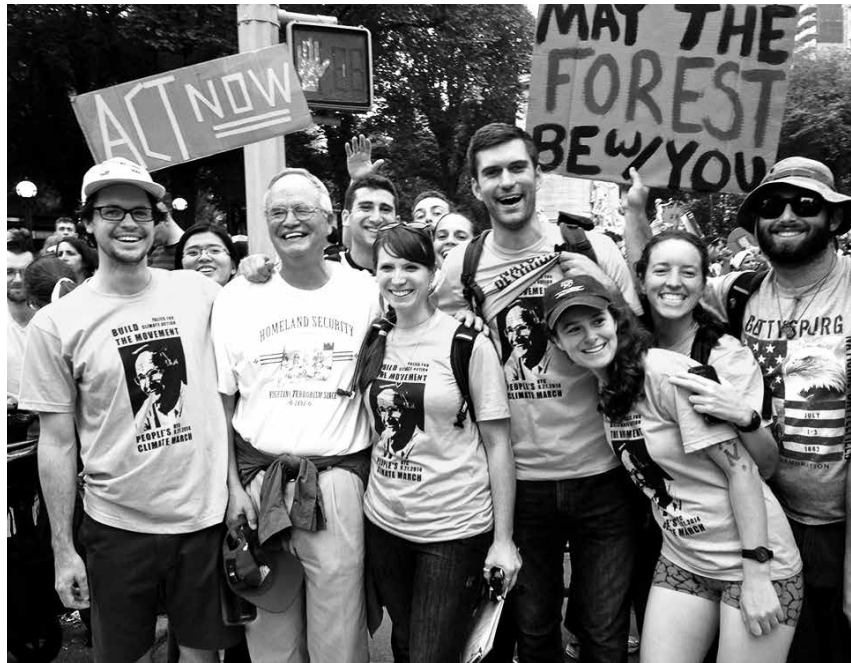
In September 2014, Gus Speth joined his students from the Yale School of Forestry and Environmental Studies in the New York City Climate March.

Well, what is an environmental issue? Most of us would say air pollution, water pollution, loss of habitat, etc. But what if your answer is that an environmental issue is anything that impedes environmental progress? That’s a much different way of looking at it. And if you think of it in that way then Trump putting all our emphasis on economic growth is an environmental issue. Consumerism