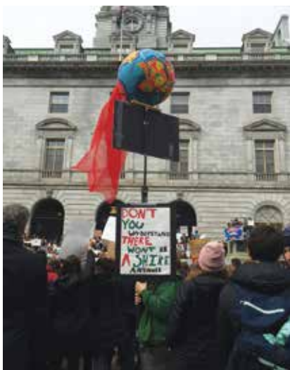
Students rally at Portland City Hall on March 15.

Sierra Club Maine has joined with student groups and several other organizations in an effort to elevate the voices of youth around the climate issue.