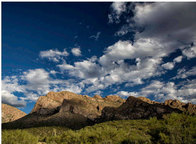
PUSCH RIDGE WILDERNESS

IN 1964 the United States charted a course for conservation that was new to the rest of the world. The Wilderness Act defines “Wilderness” as areas where the Earth and its communities of life are left unchanged by people, where the primary forces of nature are in control, and where people themselves are visitors who do not remain. The Act established the National Wilderness Preservation System on federal public lands across America—a system in which individual wilderness units are proposed by citizens who want to protect the natural values that enhance their nearby communities, improve their quality of life, and teach their children about the unaltered natural world. Wilderness designations protect the wildest pieces of our public lands that still exist: special places that look, feel, and function as they may have 200 or more years ago. The Wilderness Act was the first of its kind, anywhere in the world, and today, other nations look to our system to build one of their own.