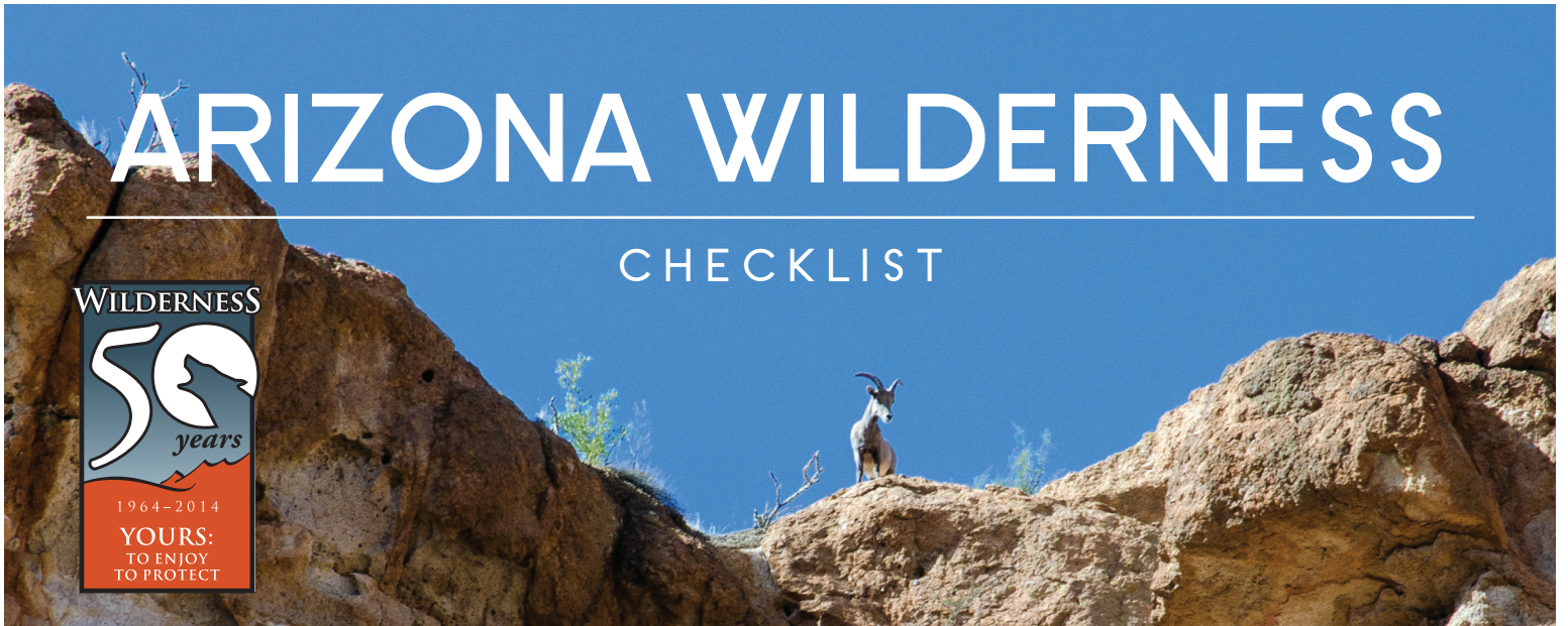
WHITE CANYON WILDERNESS