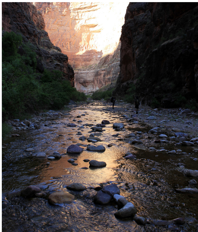
Kanab Creek evening reflections.