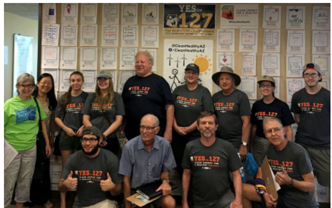
Sierra Club volunteers have been busy canvassing AZ in support of Prop. 127.