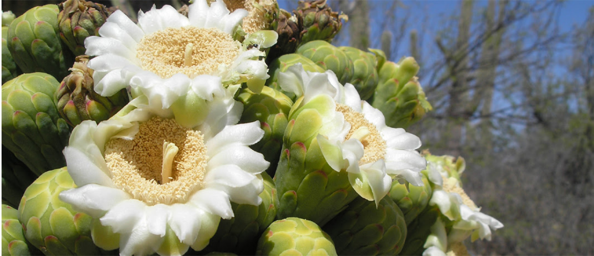
Saguaro Blossoms

To call your legislators, go to Member Roster and find their phone numbers. If you're outside the Phoenix area, you can call your legislators' offices at 1-800-352-8404. In the Phoenix area call 602-926-3559 (Senate) or 602-926-4221 (House) and ask to be connected with your legislators.