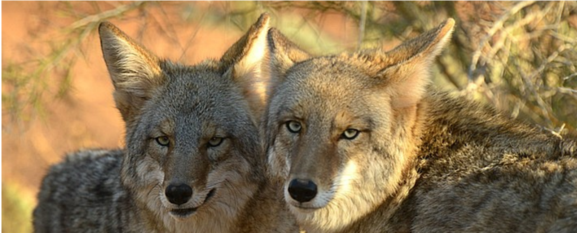
A pair of coyotes play in the desert

"The greatness of a nation and its moral progress can be judged by the way its animals are treated." — Mahatma Gandhi